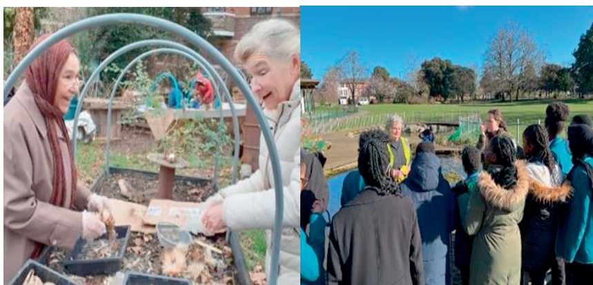
Spring clean in the community garden