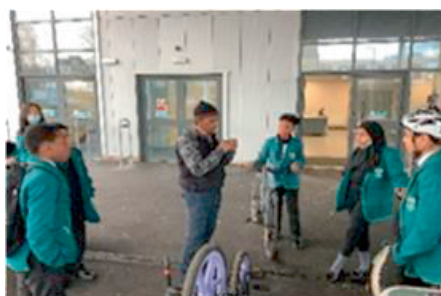
Bike Club at Harris Academy Clapham