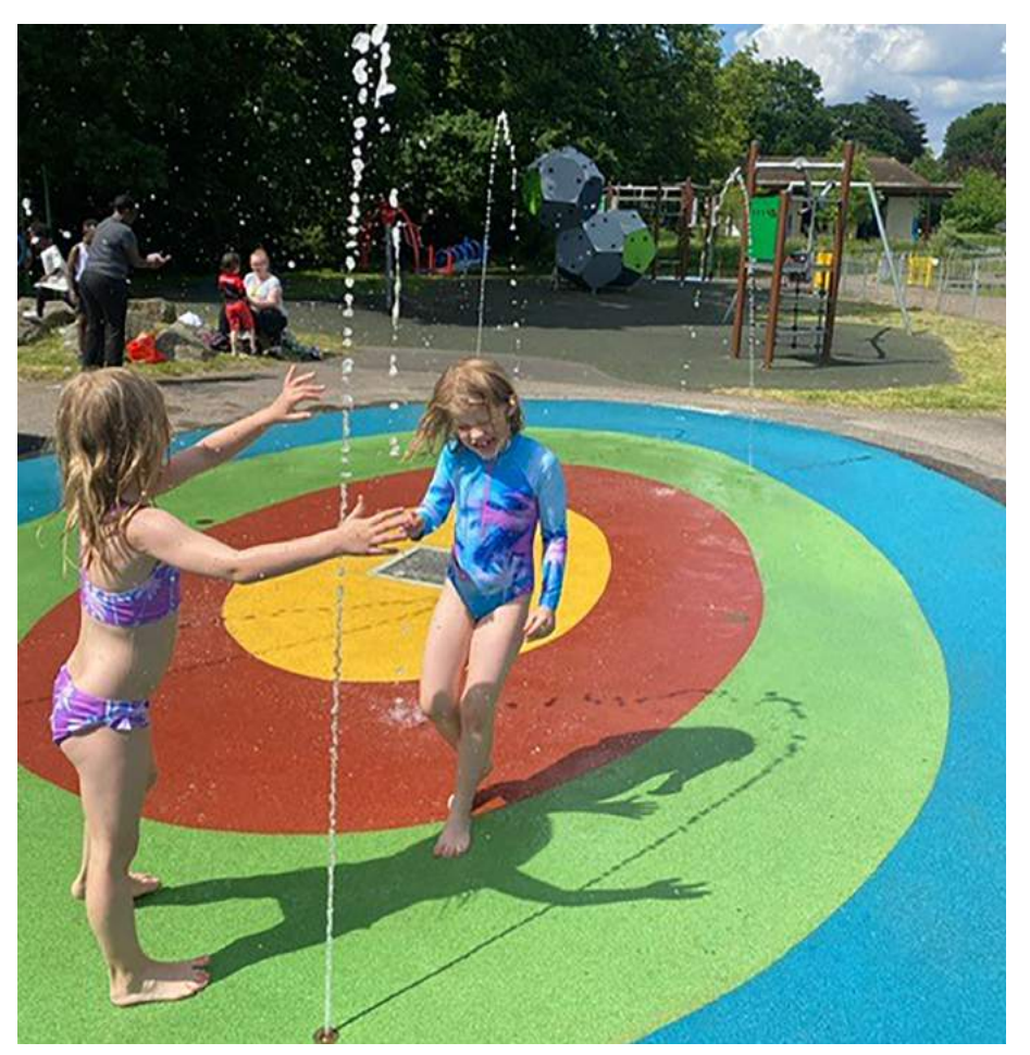
"It's a million times better than last year!"

Now that summer has finally arrived, children have been enjoying the new Splashpad in Agnes Riley Gardens. The splashpad replaces the dilapidated paddling pool which the Friends of the park have been struggling to keep going over the last few years. The installation of the splashpad is the final element of an upgrade to the playground at Agnes Riley that also includes such attractions as a track ride. The funding is provided by the redevelopment package for the Clapham Park estate. If you would like to help the Friends maintain the splashpad – it just needs you to be in the park for about 30 minutes before 10 am - please contact the Friends friends@agnesrileygardens.org.uk